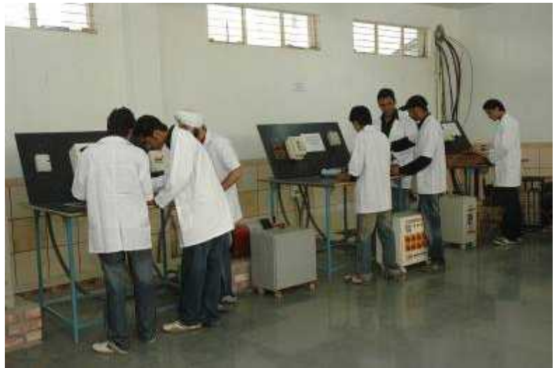
Network Theory Lab