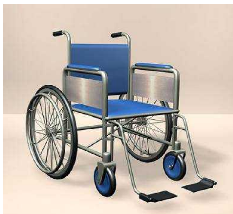
Any other facilities: Transport