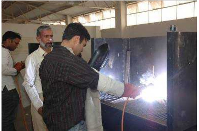
Electrical Technology Lab (Part –I)